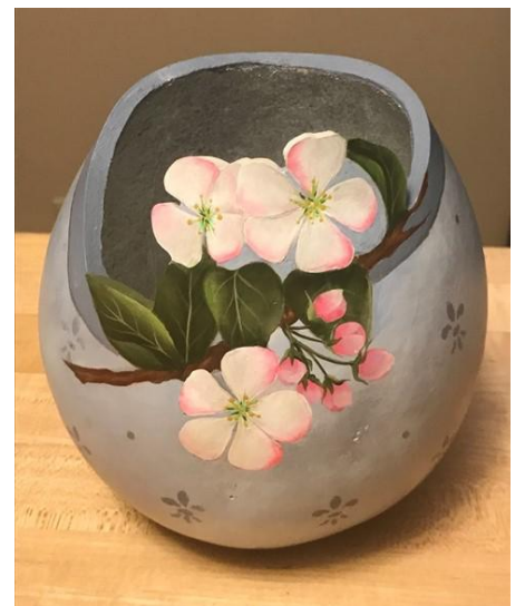
Apple Blossom Gourd 6 1/2 x 6 1/2 - Acrylics Jeanne Collick $22 includes all materials