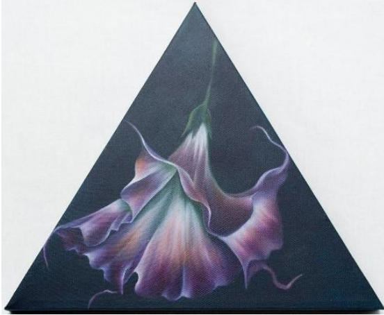
Angel Trumpet Flower Oils Triangle canvas 12 x 12 x 12 x 1 Debra Welty $20 includes all materials

Supply lists will be mailed with confirmation