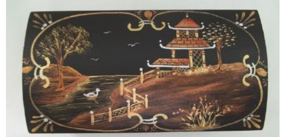
Chinoiserie Treasure Box Metallic powders 6 x 3.75 x 3 hip-roofed Judy Diephouse $26 includes all materials

Supply lists will be mailed with confirmation