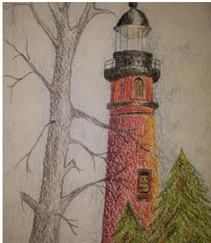
Lighthouse Cards 5 x 7 card/envelope set of 4 Colored Pencil Louise Hastings $25 - includes all materials