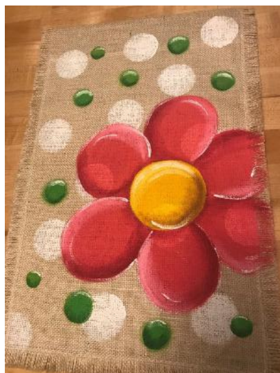
Garden Flower Flag 13 x 19 Burlap Flag—Acrylics Nancy Blaauw $15 includes all materials