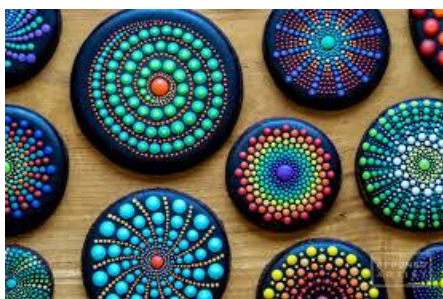
Samples – not actual class project

Saturday, April 23, 2022, 10 am. (9:30 set-up)