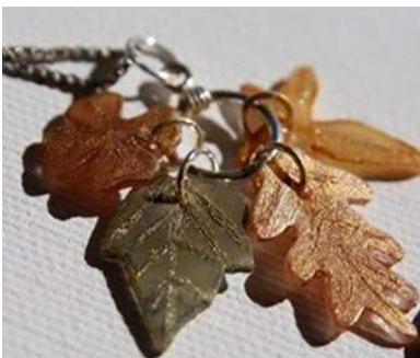
August 7, Saturday Shrinky Dink Leaves Necklace