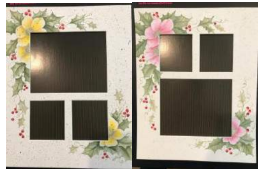
September 11, Saturday Christmas Rose (Choice of color scheme) By Faythe Nelson, Acrylics Rondi Bur