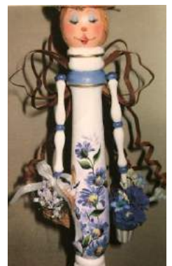
July 10, Saturday Project: Garden Angel Self Directed