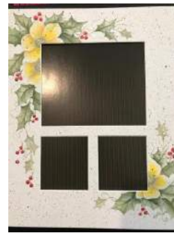
September 11, Saturday Christmas Rose (Choice of color scheme) By Faythe Nelson, Acrylics Rondi Bur