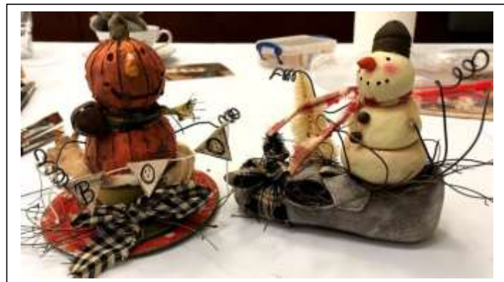
Boo & Shoe – Quik Wood & Acrylics