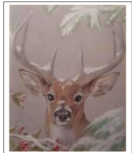
Winter Buck Colored Pencils