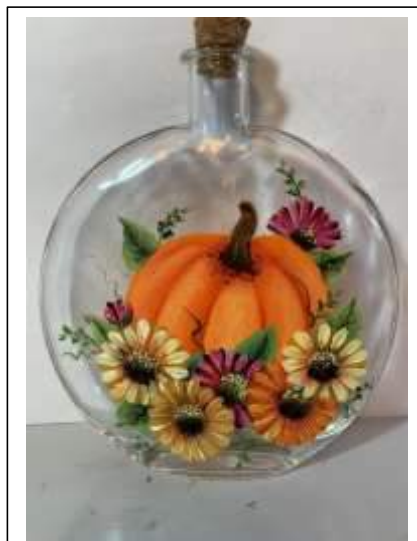
Fall Pumpkin and Floral Glass on glass of your choice – glass paints